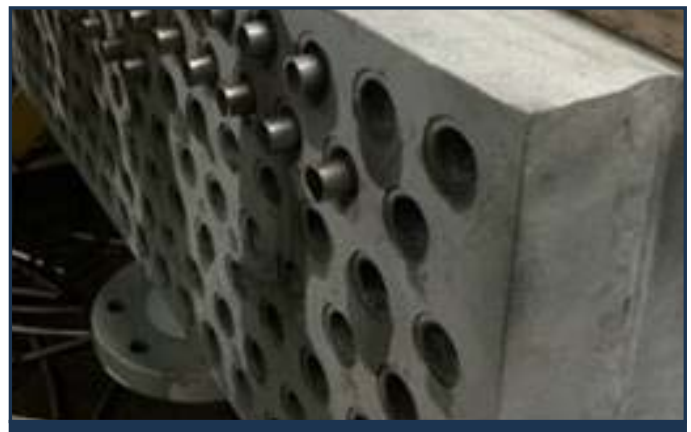
Full-length alloy liners used in a new fabrication replacement air cooler; client upgraded only primary inlet section where operating history showed tube corrosion was severe.

Curran 1000T, applied down tube in a single coat. A low-surface energy release topcoat was applied – the total coating thickness was about 75 microns. The project scope included surface prep and vacuum containment.