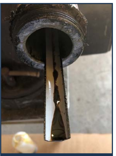
Curramix 3500 – 60 days static soak in test fixture at 650F; crude oil flowing down coated tube.

Organic hybrid, inorganic ceramic, and a PFA/PTFE form the basis of Curran applications targeted at crude processing and coking.