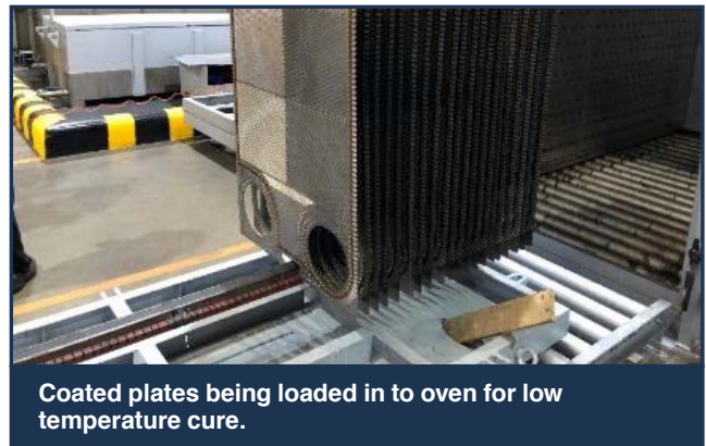
Coated plates being loaded in to oven for low temperature cure.

Coatings can be applied in the field, at OEM plate exchanger service locations. Before coating, in-service exchangers are disassembled and individual plates are cleaned for return to service.