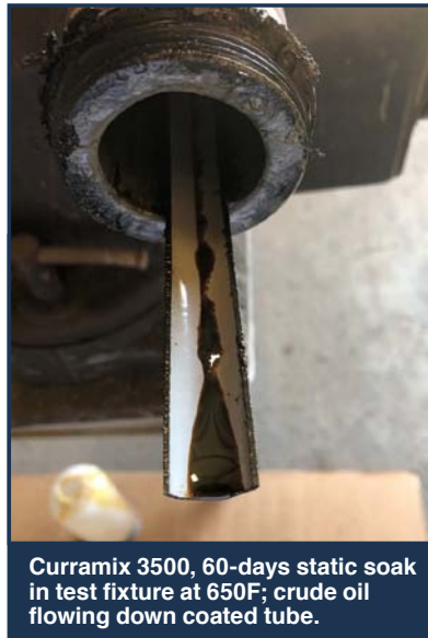
Curramix 3500, 60-days static soak in test fixture at 650F; crude oil flowing down coated tube.

Some coatings are functional at just 5-15 microns total thickness and the applied film changes interaction at the substrate; reduces surface tension <30 dynes/cm square, and surface roughness ~.5 microns.